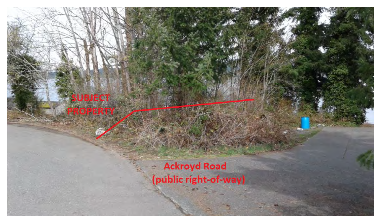
Figure 4: Ackroyd Road Right-of-Way Perspective of Subject Property