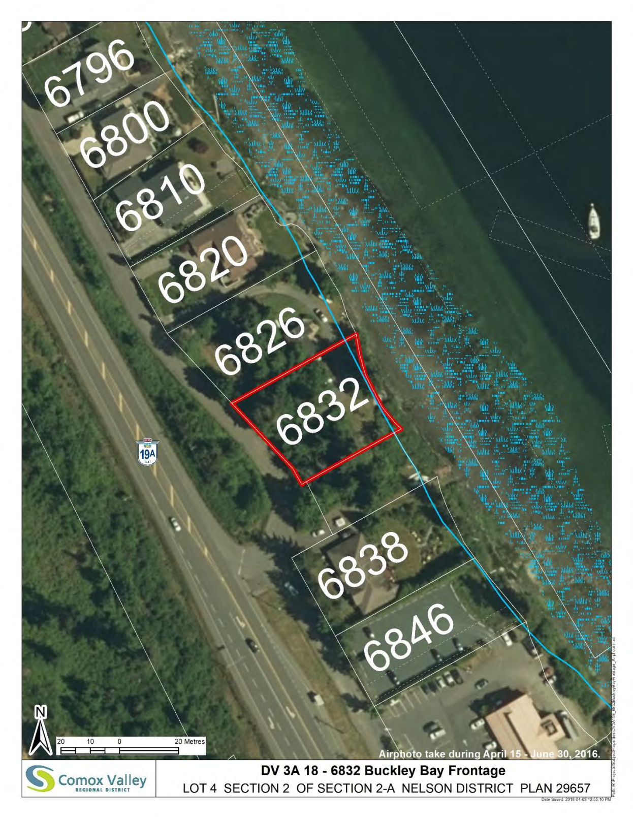
Figure 2: Air Photo (2016)