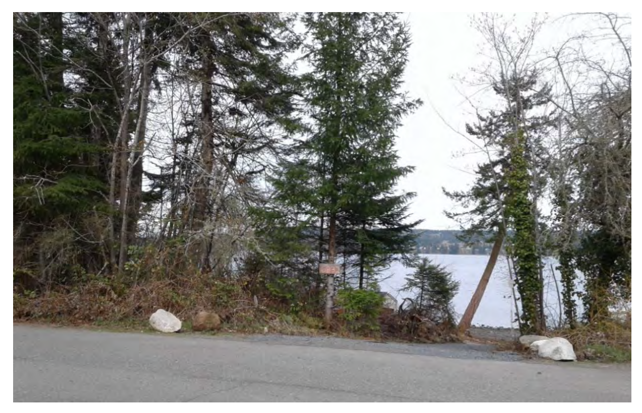
Figure 3: Subject Property, as Viewed from the Road