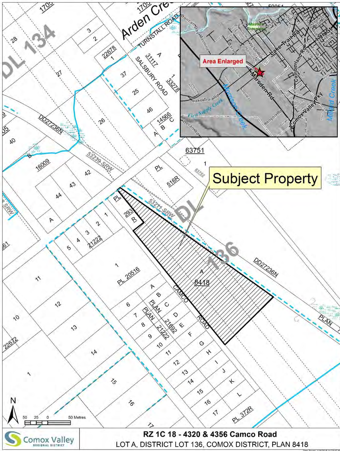
Figure 1: Subject Property Map