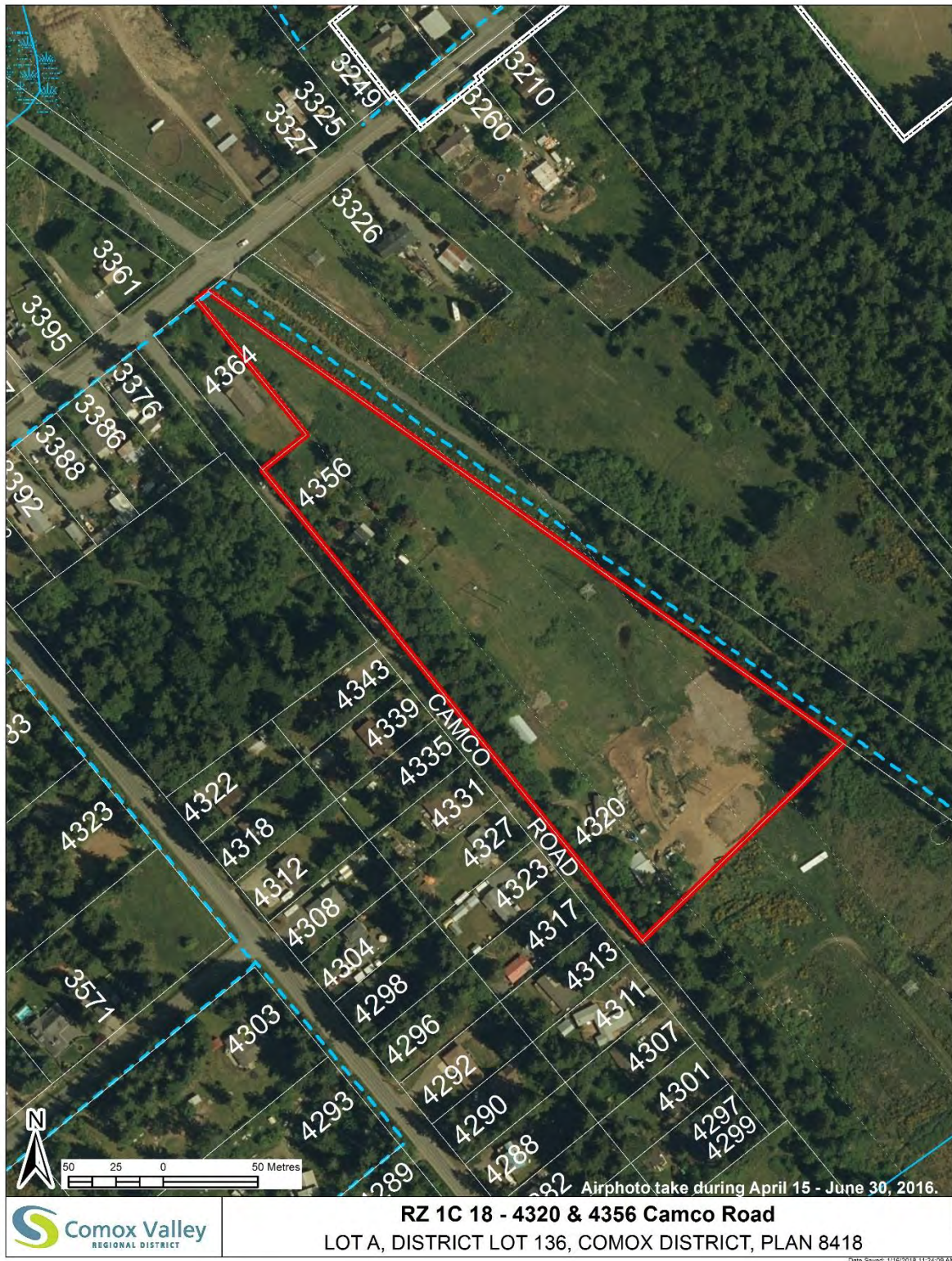
Figure 2: Air Photo