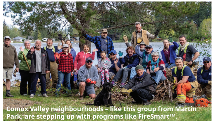
Comox Valley neighbourhoods – like this group from Martin Park, are stepping up with programs like FireSmart™.

More details about payment will be available on the back of your tax notice – along with the Home Owner Grant Program, administered by the Province.