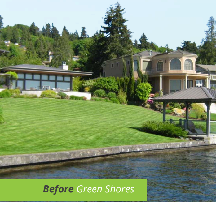
Before Green Shores

Green Shores® is an initiative of the non-profit Stewardship Centre for BC.